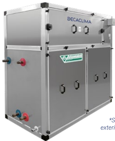
*Stainless steel exterior finish, only as an option

In naval environments, the generation of water vapour due to natural evaporation in conditions of high humidity can cause damage to construction materials, affect furniture on board and have adverse effects for people.