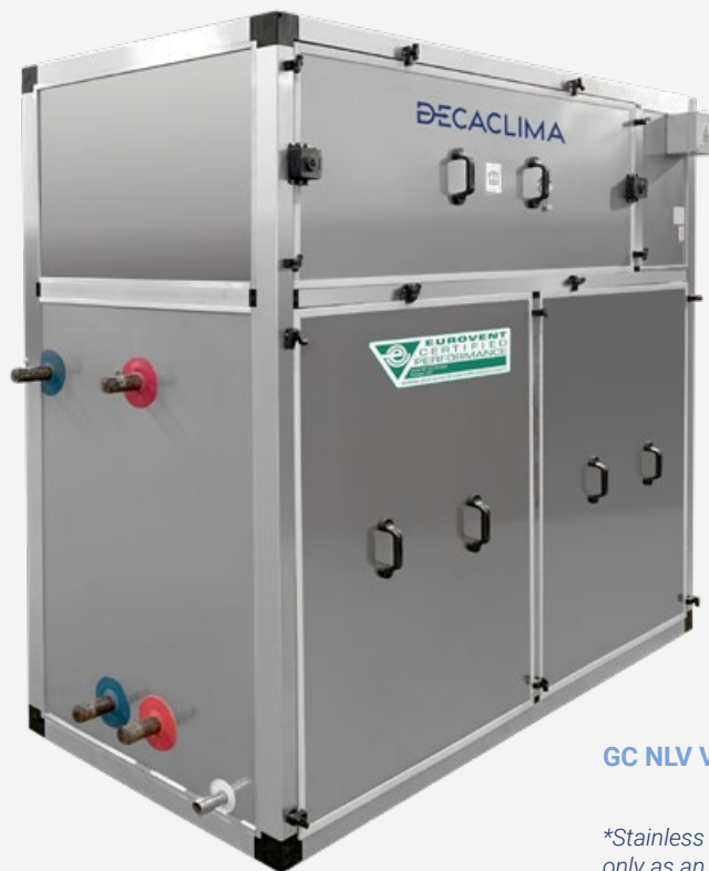
GC NLV V series

*Stainless steel exterior finish, only as an option.